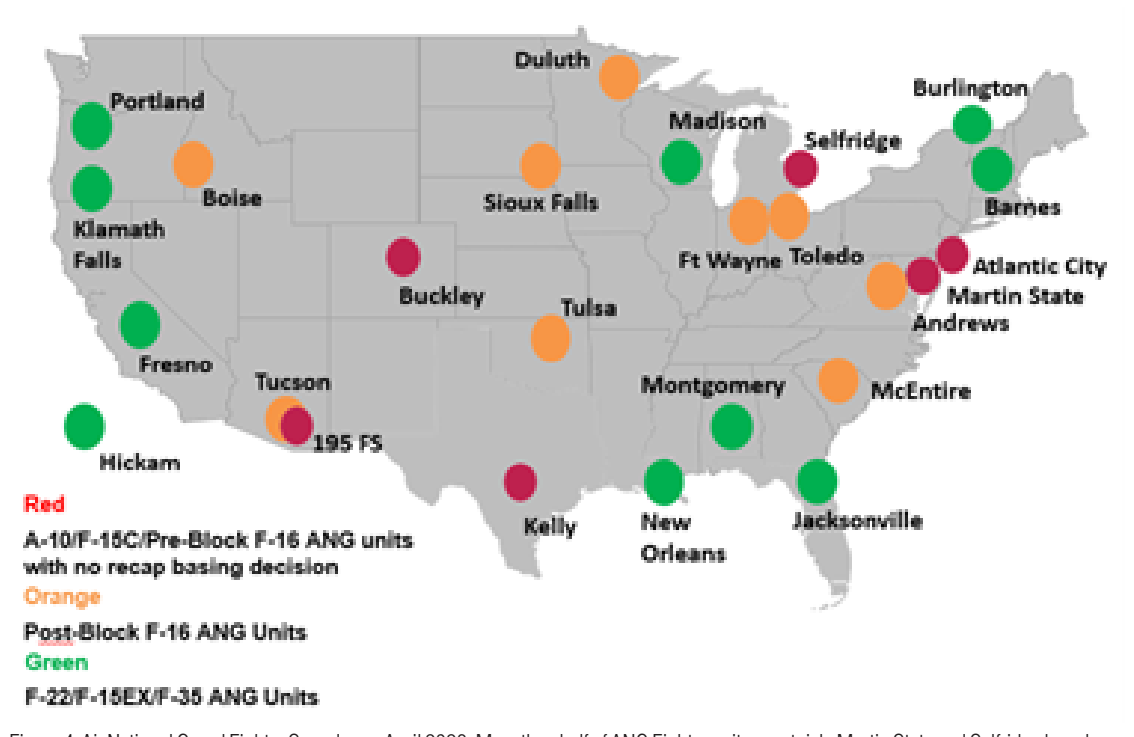
Figure 4: Air National Guard Fighter Squadrons, April 2023. More than half of ANG Fighter units are at risk. Martin State and Selfridge have been announced as losing their fighter mission; those units planned to receive "Post-Block" F-16s, the flow-down F-16s from the Active Component, remain at risk due to the age, MC rates, and relevance of those older F-16s.

The need is clear: the Air Force must recapitalize and modernize its aged fighter fleet if it ever plans to stop its current force structure decline—and then grow its combat capacity. As the Air Force divests older aircraft such as A-10s and F-15Cs, experienced pilots must learn and acquire operational experience in the more advanced aircraft that replace them, as well as the tactics, techniques, and procedures (TTPs) for employing them effectively in combat. Even experienced instructor pilots, when assigned to a new aircraft type, must attend a transition course and regain their qualifications through upgrade programs. Transitioning from one type of aircraft to another can stress squadrons, which must absorb both new pilots and transitioning pilots. Both activities require increased supervision.